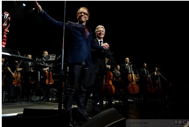
Danny Elfman (composer & LA special guest) & John Mauceri (conductor)