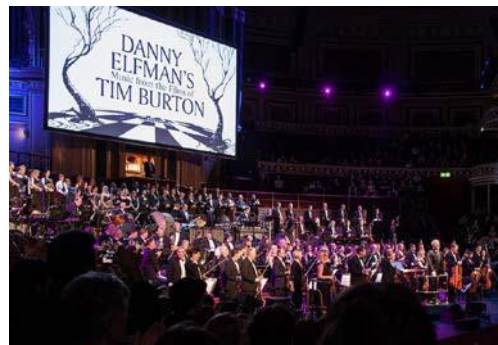
The BBC Concert Orchestra & the Maida Vale Singers