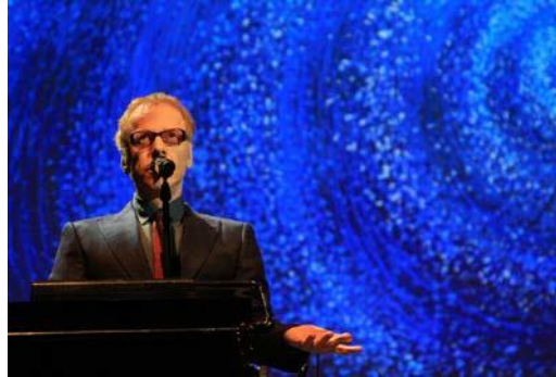
Danny Elfman (composer & UK special guest), performing live