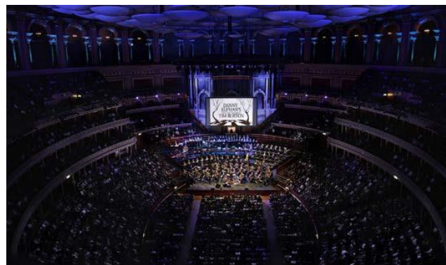
Royal Albert Hall, World Premiere Performance of “Danny Elfman’s Music from the Films of Tim Burton”