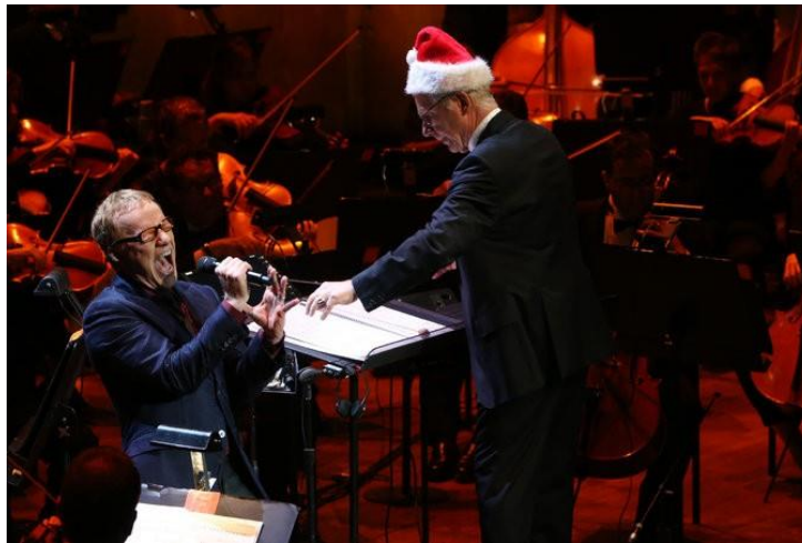
Danny Elfman, singing, and John Mauceri conducting Mr. Elfman's Tim Burton scores, at Lincoln Center on Monday.