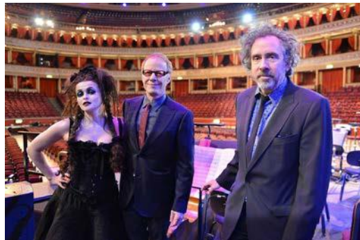
From left: Helena Bonham Carter, Danny Elfman (composer) & Tim Burton (films & artwork) – all special guests